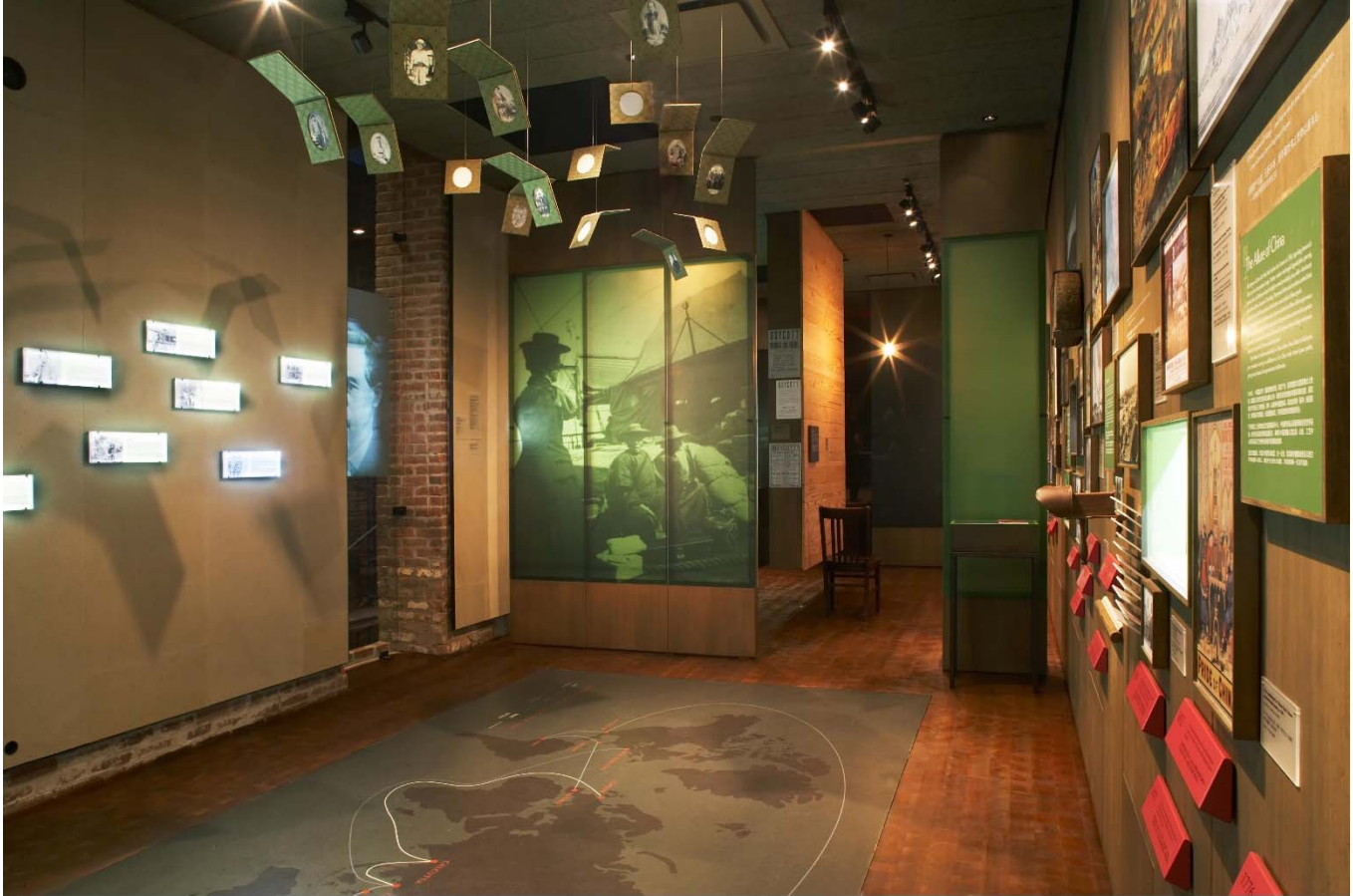
Core Exhibition Hall: "With a Single Step: Stories in the Making of America." Permanent exhibition designed by Matter Practice / mgmt. design, with lighting by Marcus Doshi.